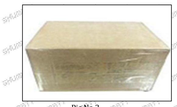
Pic No.2 Domestic express packaging: Wrapped by Transparent tape

Minors are prohibited from using transparent tape, yellow tape, black wrapping protective film, and white wrapping protective film to avoid personal injury.